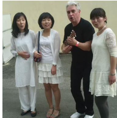
CZECH UKULELE FESTIVAL - Únětice 2013

O kina daj-ko Ton, Ton Czi-sa-na dai-ko Ton, Ton, Ton O kina daj-ko czi-sa-na dai-ko Ton, Ton Ton, Ton, Ton